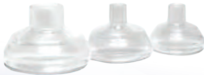
Round Silicone Masks