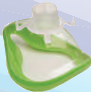
Intersurgical® QuadraLite™ Masks