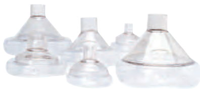
Clear Anatomical Face Masks