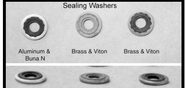
Figure 2: Examples of some sealing washers available for CGA 870 Style medical post valves.