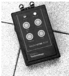
#BO-7100 Microstim Plus

Neuro Technology Microstim Plus (#BO-7100) Serial Numbers