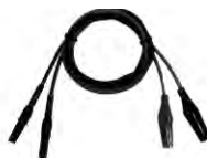
#19-00-107P 50" Leads with Alligator Clips