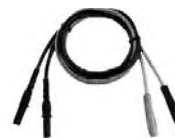
#19-00-110P 50" Extension Leads w/male & Female ends