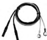
#19-00-108P 50" Leads with snaps

This Safety adapter kit allows the conversion of older models to accept compliant protected lead sets. Does not alter equipment function. Ball electrodes can still be used normally. Comes complete with 2 adapter jacks, allen key for installation and instructions.