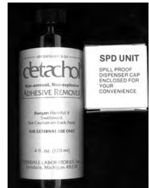
#69-21111 Detachol.™ Great for removal of stubborn adhesives. Safe for most surfaces. 4fl. oz.