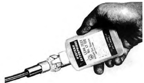
#69-21101 Liquid Leak Detector. Pinpoints any gas leak as small as .0001cc per second. Safe for use with oxygen. 8 oz. bottle.