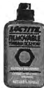
#69-21102* Service Removable Loctite 50cc bottle. (242) #69-21127* Red Loctite (271) 50cc Bottle * NOTE: Not for use with oxygen.