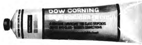
#69-21110 Vacuum Grease. Silicone lubricant for threads, O-rings, gaskets and seals in vacuum systems. 5.3 oz. tube.