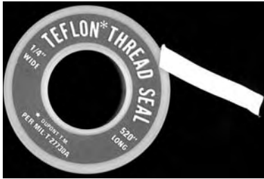
#69-21103 Teflon Tape. Pipe thread sealant, 576" roll, 1/4" width.