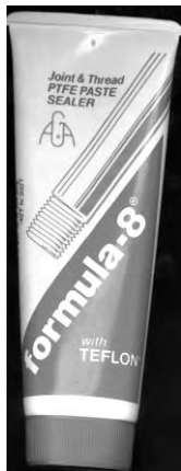
#69-21108 Thread Paste Compound 3-1/2 oz. tube.