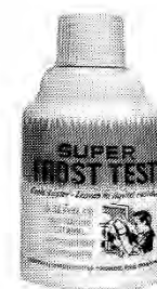
#69-21107 Freeze Spray Component Cooler 15 oz. can