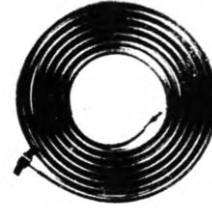
Oxygen Pressure Hose male/female threaded connector (9/16"-18)