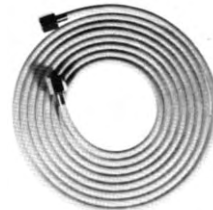
Nitrous Oxide/Medical air Pressure Hose female/female threaded connector (3/4"-16)