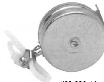
#69-206-14 Hose Retractor 18" Length